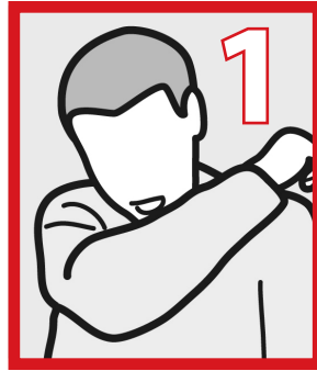
Cover your cough